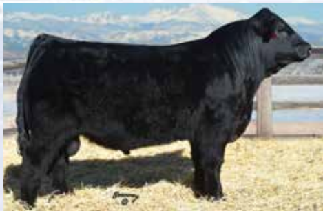
COLE Daytime 17D