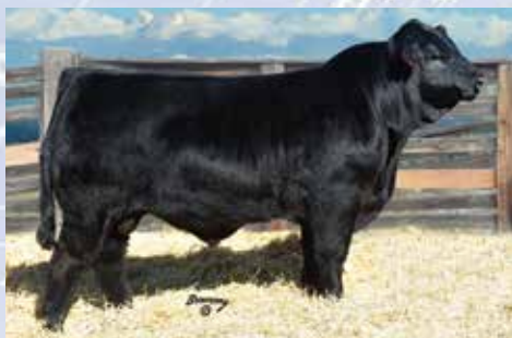
COLE Denver 02D