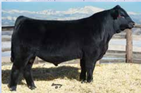
COLE Direction 55D