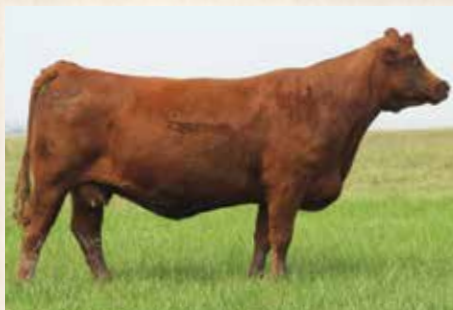
COLE Miss Purepower 809U - Dam of Lot 11