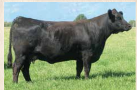
COLE Miss Production 0101X - Dam of Lot 22