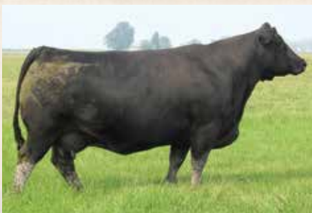
COLE Miss Production 878U - Dam of Lot 23