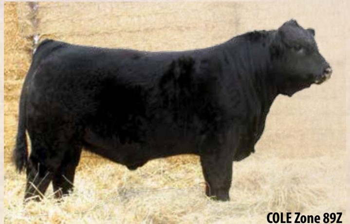
COLE Zone 89Z