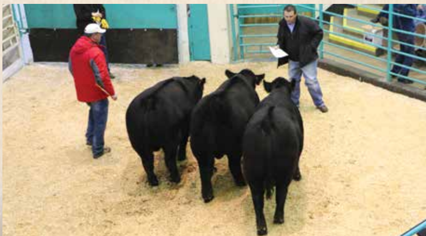
2016 COLEMAN ANNUAL BULL SALE