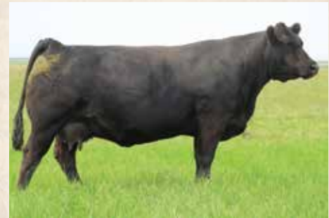
COLE Miss Production 845U - Dam of Lot 3