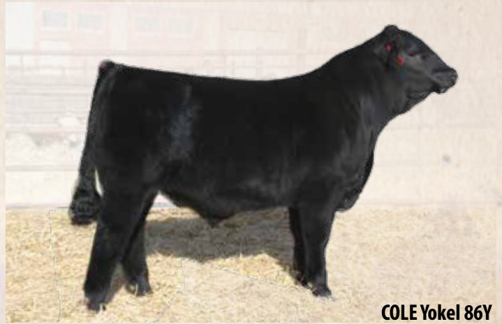
COLE Yokel 86Y