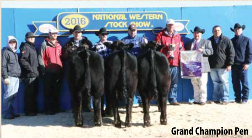
Grand Champion Pen