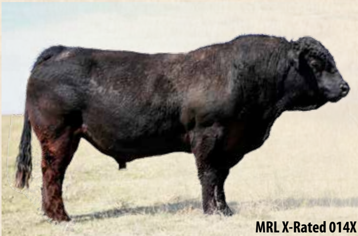
MRL X-Rated 014X