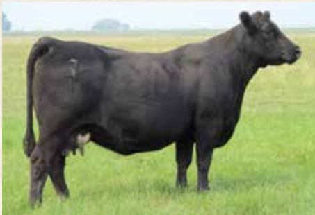
COLE Miss Windfall 185Y - Dam of Lot 1