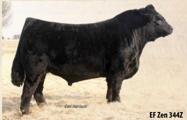
EF Zen 344Z