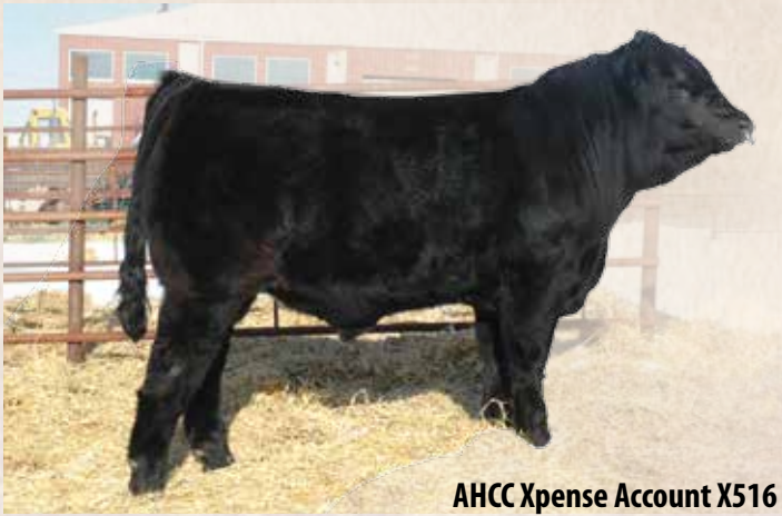
AHCC Xpense Account X516