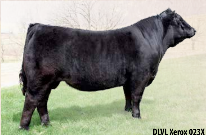
DLVL Xerox 023X