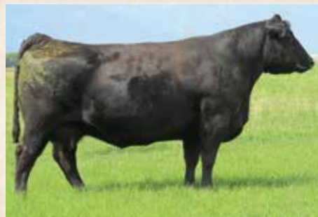
COLE Miss Production 9179W - Dam of Lot 13