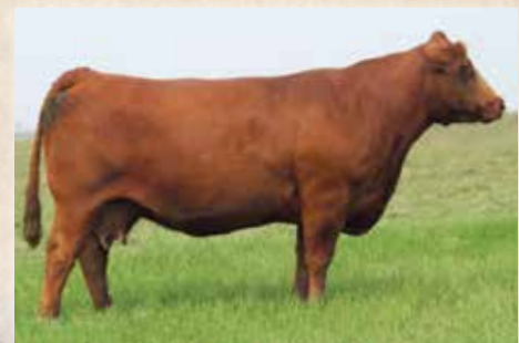
COLE Miss Justice 634S - Dam of Lot 95