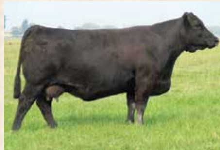
COLE Miss Nasa 975W - Dam of Lot 2