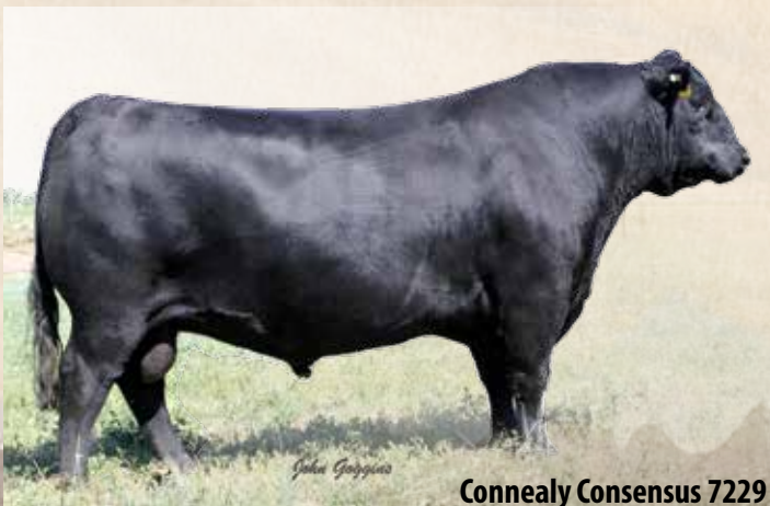
Connealy Consensus 7229