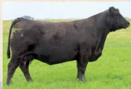
COLE Miss Production 956W - Dam of Lot 53